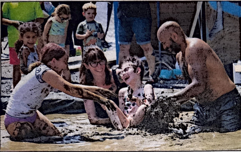
The 11th annual Mess Fest took place Aug. 3 at Kiwi Country Day Camp in Mahopac, where kids and families enjoyed a day of summer fun.

EDITORIAL@PUTNAMPRESSTIMES.COM WEDNESDAY, AUGUST 14, 2024