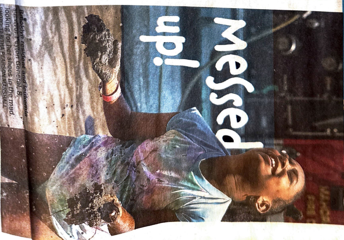
Brooklyn resident and leukemia survivor looking for her shoes in the mud.