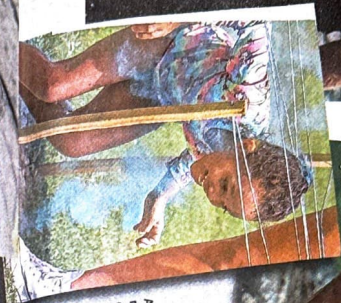
Akira Patano, 6, runs through the obstacle course as a volunteer sprays a vol cloud of blue paint on her.